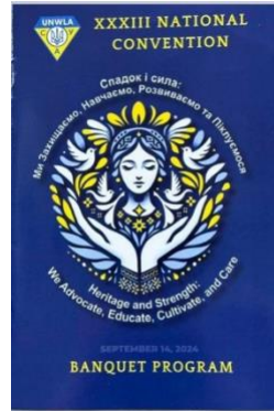
Next year we turn 100 years old!