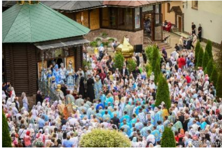
Metropolitan Epiphany officiated at the Monastery of the Holy Cross on the Feast of the Manyava Icon of the Mother of God in Prykarpatia