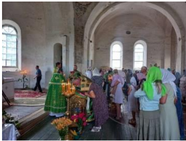
The village church in Ozarintsy, Vinnitsa Oblast, was the scene of its first Divine Liturgy in 93 years on June 25th