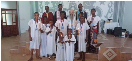
34 catechumens were baptized in Tanzania in two parishes on the Feast of Pentecost

Day of the Holy Spirit was observed at Holy Trinity Cathedral in Jerusalem with the Hierarchical Divine Liturgy celebrated by Patriarch Theophilos III.