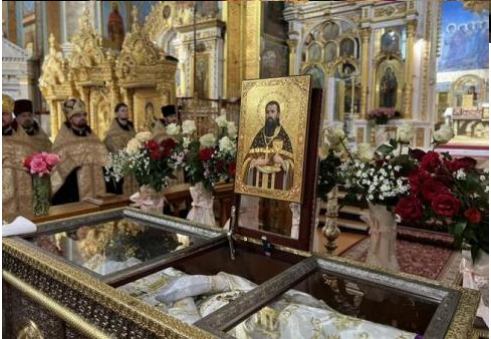
The 100th anniversary of the repose of St. Jonah (Atamansky) of Odesa was celebrated at the Cathedral of the Dormition where his relics lie

The Macedonian Orthodox Church glorified 3 new saints including the siblings: Righteous Spase & Spasa at St. Sofia’s Cathedral in Ohrid