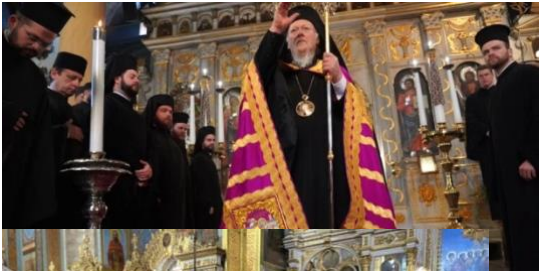
The Ecumenical Patriarch Bartholomew I attended the International Peace Summit for Ukraine held in Switzerland