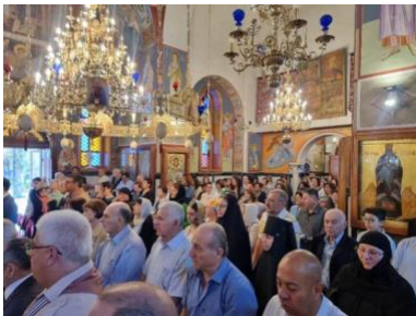
Festive celebrations were held on Thomas Sunday in Cana of Galilee, led by Patriarch Theophilos III of Jerusalem

Fourteen Baptisms and 2 Chrismations took place at St. Mark Orthodox Church in Rochester, Michigan during Holy Week