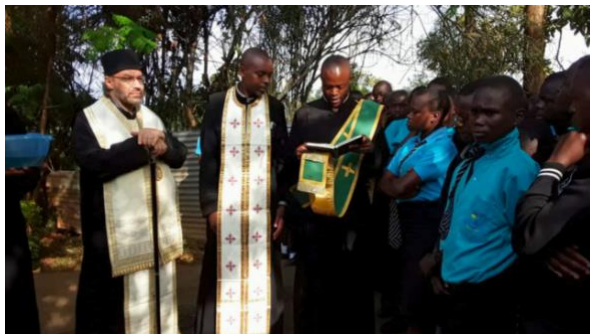
With aid from OCMC, a new borehole was dug at the Bishop Makarios Secondary School in Migori, Kenya which houses 800 students