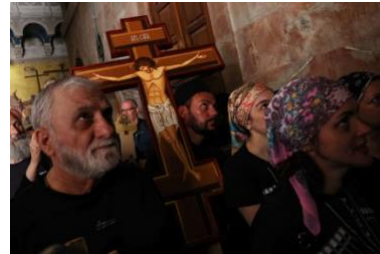
Procession in Jerusalem from the Holy Sepulcher to Golgotha.