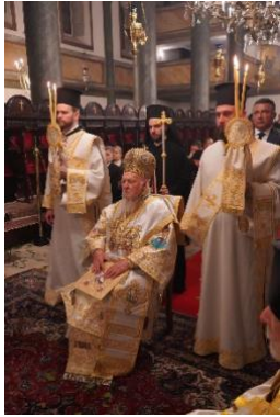
Ecumenical Patriarch Bartholomew I celebrated Paschal Liturgy in Constantinople at St. George Cathedral