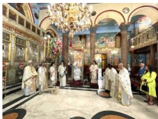
Patriarch Theodore II of All Africa celebrated the Holy Pascha in the Cathedral of the Annunciation in Alexandria, Egypt