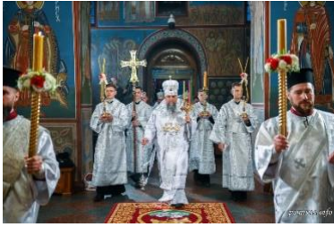
Pascha at St. Michael's Golden Domed Cathedral in Kyiv