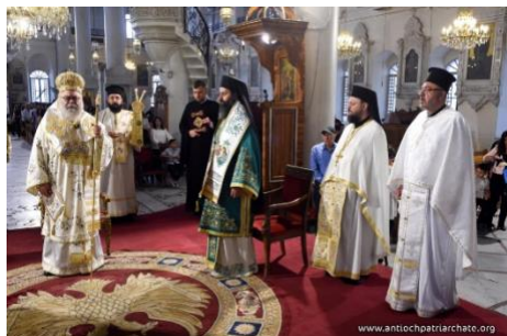
Patriarch John X of Antioch led Palm Sunday services in the Cathedral of the Virgin Mary in Damascus, Syria