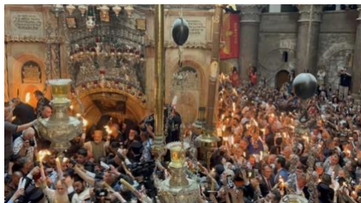
Service of the Holy Fire was performed by Patriarch Theophilos III at the Church of the Holy Sepulchre in Jerusalem on Holy Saturday

The Office of Youth & Young Adult Ministry offers ongoing internship opportunities with their office for college students or young adults. More here: www.uocyouth.org/uocinternshipprogram