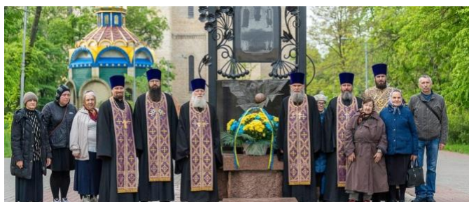
The 38th Anniversary of the Chernobyl on April 28th tragedy was observed throughout Ukraine with memorial services for the victims