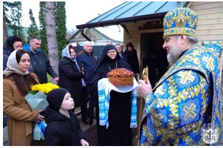
The new Church of the Annunciation at the Convent in Vinnitsa, Ukraine was consecrated by Metropolitan Simeon