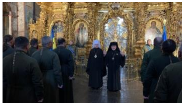
Graduation ceremonies for military chaplains of the National Guard of Ukraine were held in St. Sophia's Cathedral in Kyiv on Feb.18th