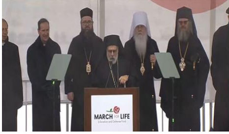
Orthodox Christians participated in the annual March for Life in Washington, D.C. led by four Orthodox hierarchs of the Americas on Jan. 21st.