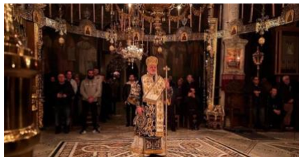
On Jan. 19th Archbishop Elpidiphoros of America ended his 4 day visit to Mt. Athos, celebrating the Theophany Liturgy at Xenophontos.