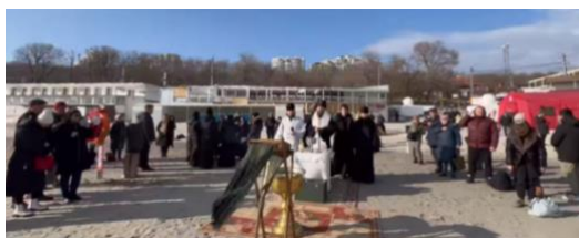
Several bishops of the Odessa Diocese blessed the waters of the Black Sea on the Great Feast of Theophany.