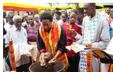
Bishop Silvester of Jinja, Uganda presided over the baptism of 20 people in the village of Isegero on Jan 21