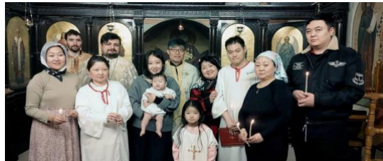
On Jan. 15th a group baptism was held at St. Maximos Chapel in Seoul, South Korea.

The Italian government has allocated 500,000 euros for the restoration of Odessa Transfiguration Cathedral damage by a Russian missile.