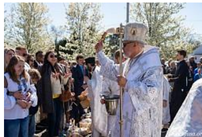
S.Bound Brook, New Jersey